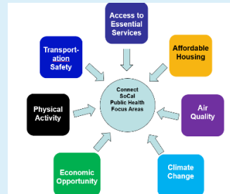
Figure 2. SCAG's Public Health Focus Areas