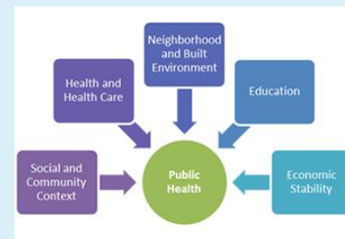
Figure 1. Office of Disease Prevention & Health Promotion Social Determinants of Health (SDOH)