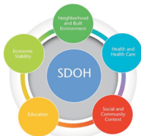
Figure 1. Social determinants of health

In OC, the percent of people living with diabetes has continued to increase by relatively 2.5% each year. With high obesity rates and increasing health risks, the need for health programs focusing on fitness and nutrition education for the city of Buena Park.