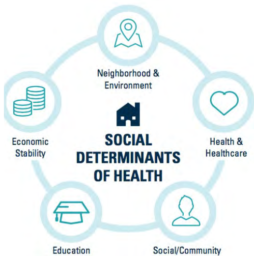
Figure 2: SDOH are the non-medical factors that influence health, including aspects of a person’s social and physical environment.

Jamboree Housing is a non-profit, affordable housing company based in California that delivers high-quality affordable housing and services that transform lives and strengthen communities. This project aims to create a data-based guide to visualize levels of social determinants of health (SDOH) at each property to tailor future decisions.